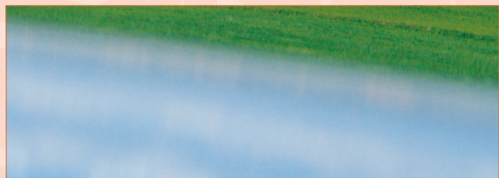
...the fortress town of Samtsevisi...