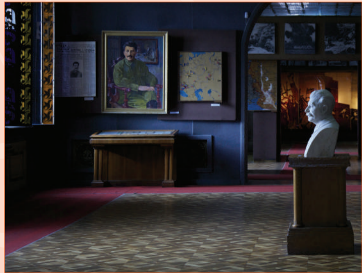
...Joseph Stalin Museum